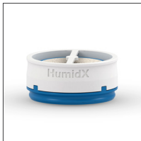
HumidX 38808 (50 pk) HumidX 38809 (3 pk) HumidX 38810 (6 pk)