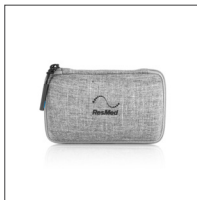
AirMini Travel Case 38841