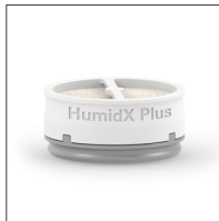
HumidX Plus 38811 (50 pk) HumidX Plus 38812 (3 pk) HumidX Plus 38813 (6 pk)