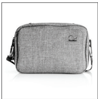
AirMini Travel Bag 38840