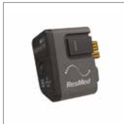
Oksimeteradapter 37302 XPOD LP Oksimeter 22374 Flerbruks soft sensor (medium) – 3 meter kabel 707560