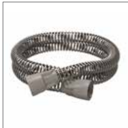
SlimLine™ slange 36810