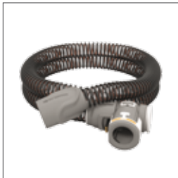
ClimateLineAir™ slange 37296