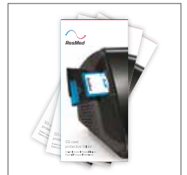
Omslag til SD-kort 37334 (1 pk) 37332 (10 pk) SD-kortleser 36931