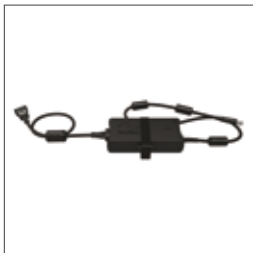
90W Strømforsyning 37346