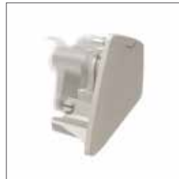
Sidedeksel 37335 Grå (AirCurve) 37303 Koksgrå (AirSense)