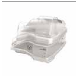
HumidAir varmfukter 37300 Vannkammer