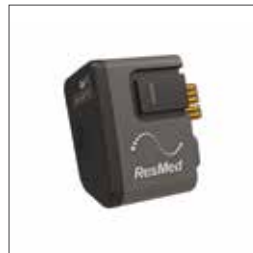
USB -adapter 37301