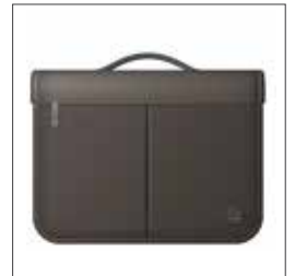
Bæresveske 37304 Bæresveske for Her 37305