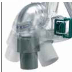
Rotating elbow—flexibility of air tube position