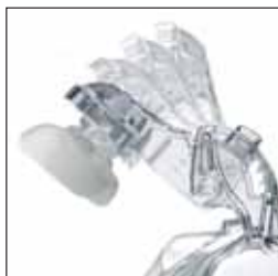
Adjustable forehead support—four clearly numbered positions