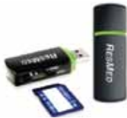
SD Card Reader 36931 • USB extension cable 7071015