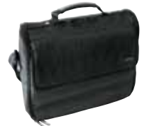
S9 Travel Bag 36860