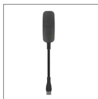
AirMini 20 W AC Adapter 38831