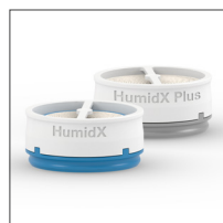
HumidX 38809 (3 pk) HumidX 38810 (6 pk) HumidX Plus 38812 (3 pk) HumidX Plus 38813 (6 pk)