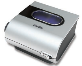
H5i Heated Humidifier